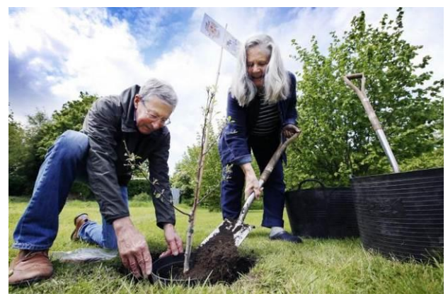
simultaneously planted in both Oxford and the French city of Grenoble to celebrate 30<sup>th</sup>